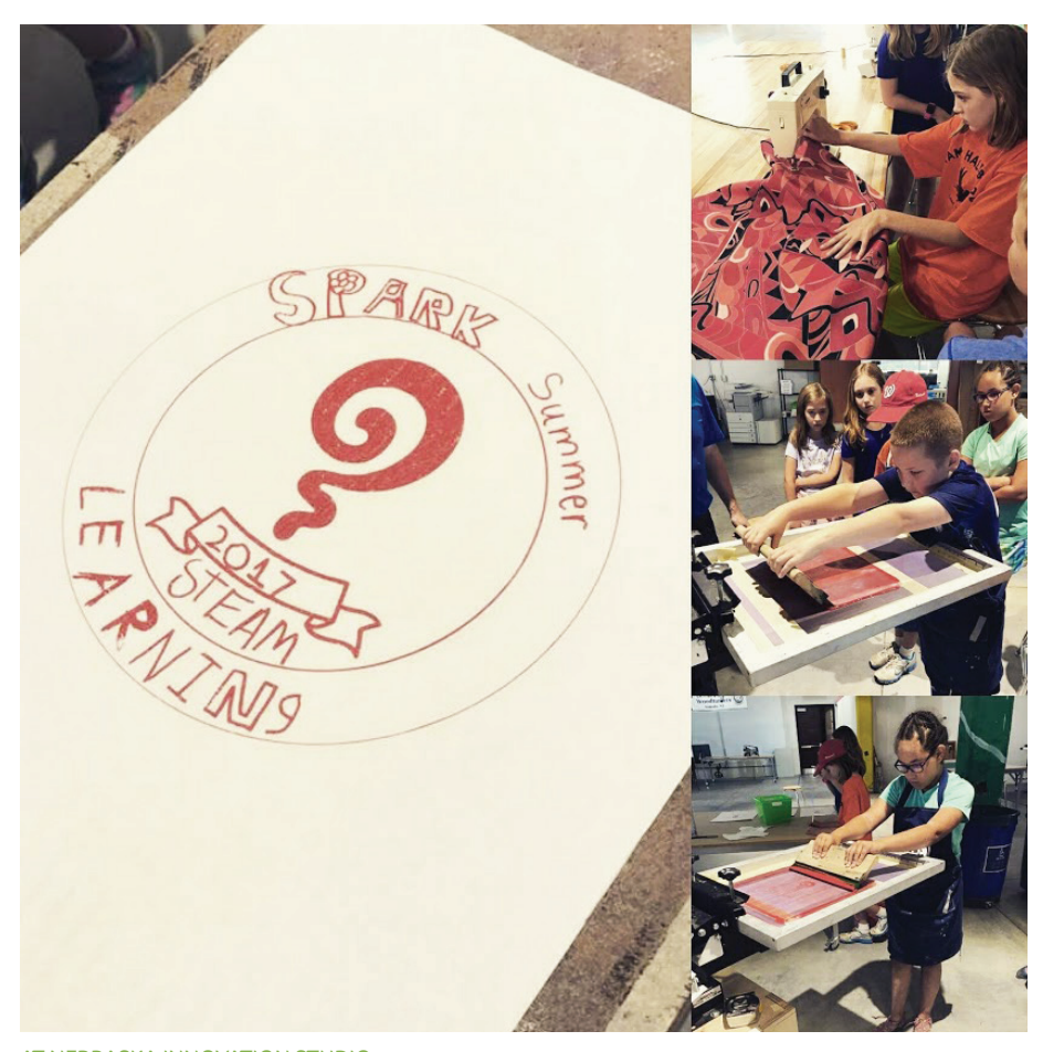
AT NEBRASKA INNOVATION STUDIO

Spark Summer Learning is a new STEAM (Science, Technology, Engineering, Art, and Math) enrichment program at the Foundation for LPS that looks like a maker's paradise. Created to help working parents find a fun learning environment for their kids over the entire summer, Spark also gave parents the option for their child to drop in for a week or more, as needed.