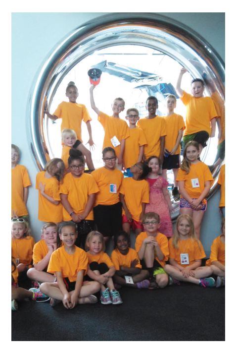
VISITING DUNCAN AVIATION

Registration opens January 15, 2018 for next year.